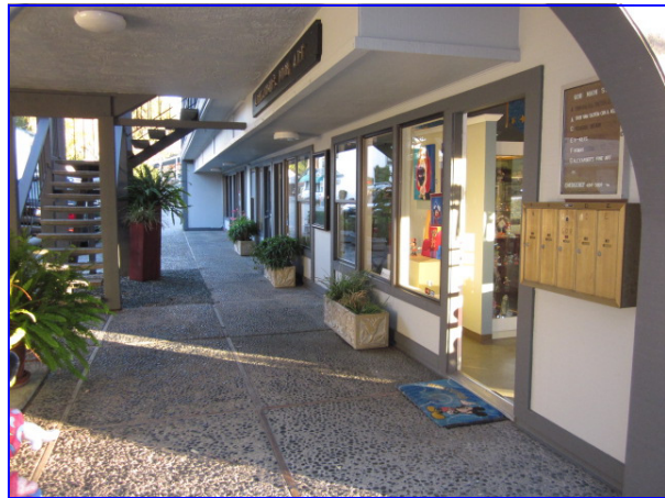
Entry & Courtyard Glass line