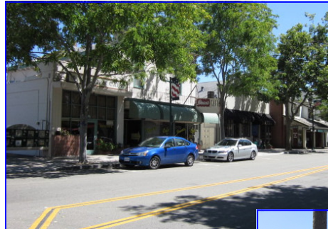
Dean's to Building