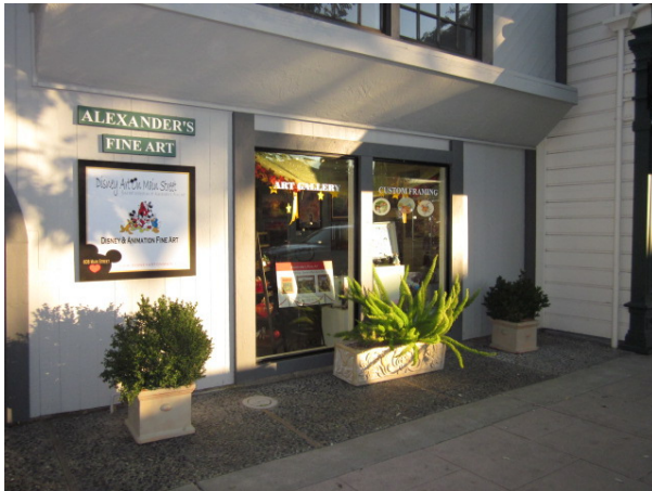
Front of Building Windows onto Main Street!

Get the iPhone app for Downtown Pleasanton! Droid coming soon!