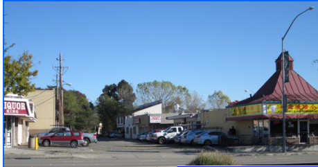
Retail & Office

5502 Sunol Blvd. Pleasanton, CA 94566 (925) 425-9852